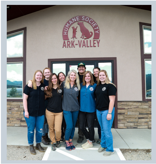
AVHS staff team