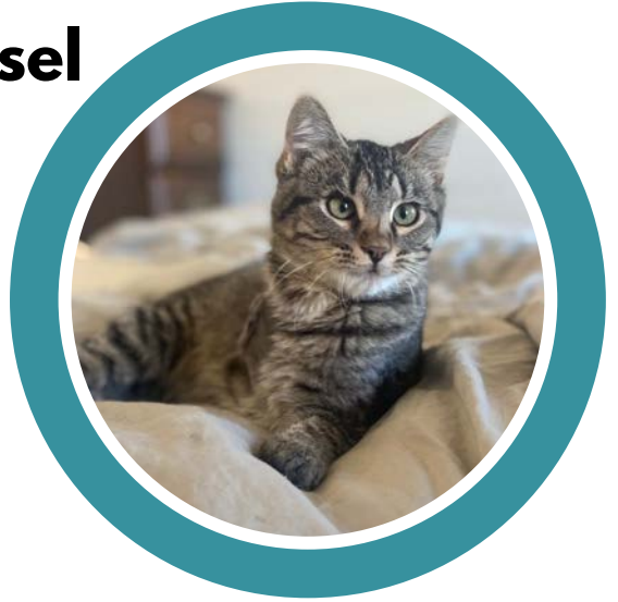
Easel in her forever home!