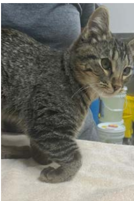
Easel on intake